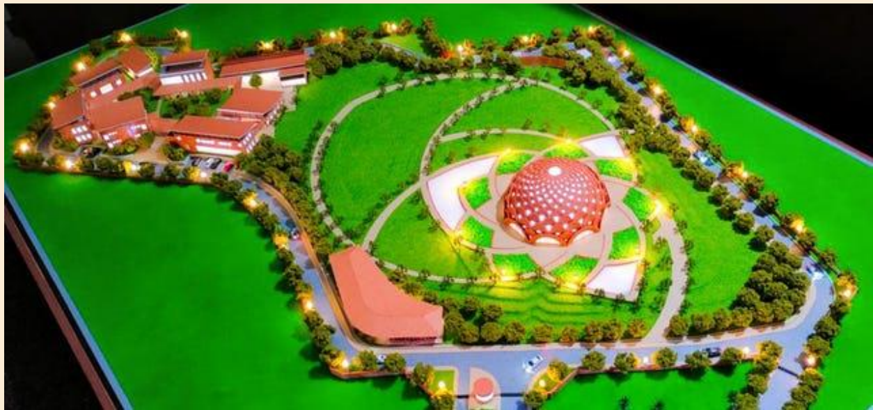
A scale model of the design for the temple and surrounding facilities

HARGAWAN, India — Ground was broken today for the first local Bahá'í House of Worship in India—an edifice from which will emanate the spirit of worship and service that has been fostered over decades in the local area, known as Bihar Sharif. The groundbreaking ceremony marked the start of construction of this edifice, which is among the seven Bahá'í temples announced in 2012.